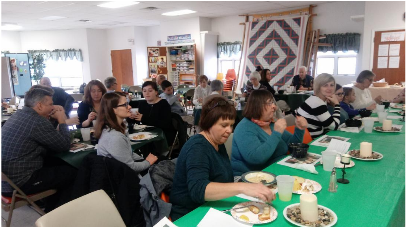
Gathered to watch Martin Luther documentary

February 11 One Service: 9:00 am, followed by yearly Congregational Meeting