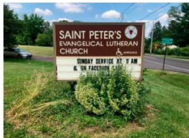
Current church sign