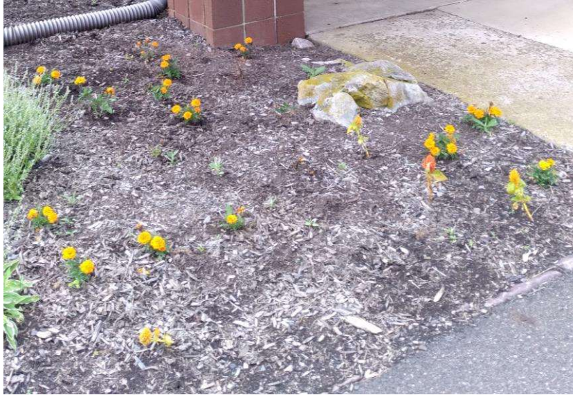
Flowers planted by the 4H clubs that meet at St. Peter's

St. Peter's Evangelical Lutheran Church Hilltown, PA July/August 2025